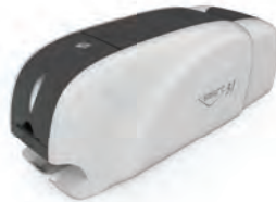
Dual sided ID CARD PRINTER smart-31 D