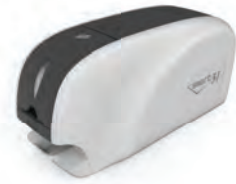
Rewritable ID CARD PRINTER smart-31 R