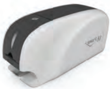
Single sided ID CARD PRINTER smart-31 S