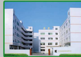
Time Attendance: Factory