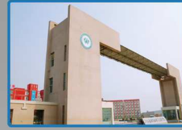
Networked Security: School