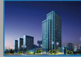
Networked Security: Building