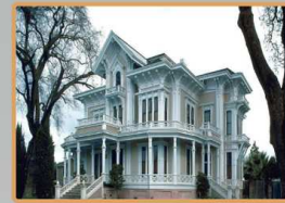
Standalone Access Control: House