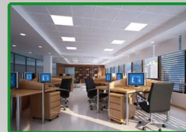
Time Attendance: Office