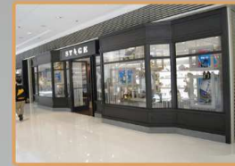
Standalone Access Control: Shop